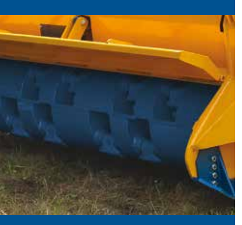
Swinging hammer options Ideal for use on green vegetation for shredding.

7 belt drive on SD models and 12 belts (dual drive) on HDX ranges.