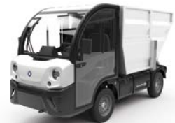
Garbage Collection Skip