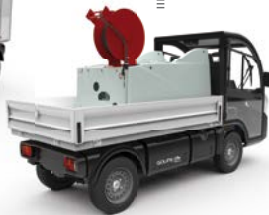
Hosing / High Pressure Cleaner