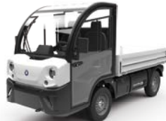
Fixed or Tilt Deck