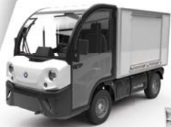
Roll-up Door Van